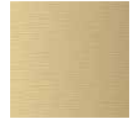
Brushed Brass SR232BB