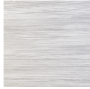
Brushed Nickel SR232NK