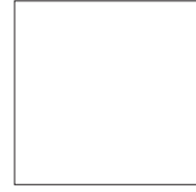
Matte White SR232MW