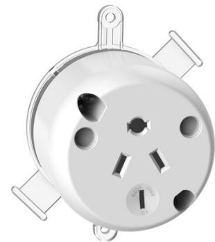
Clipsal 413/4P Adapter